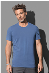
ST9600 Clive Crew Neck