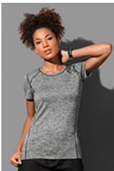
ST8940 Recycled Sports-T Reflect