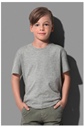
ST2220 Classic-T Organic Kids