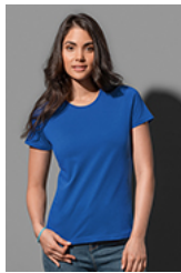
ST2620 Classic-T Organic Fitted